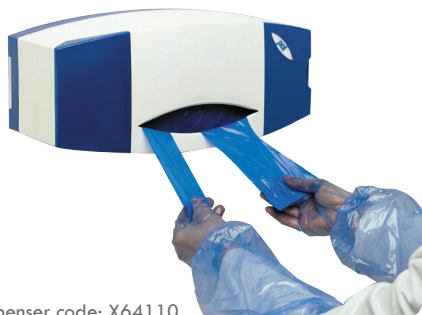
Dispenser code: X64110

The aprons are supplied on rolls for maximum convenience when used with the Pal Ecopak dispenser.